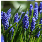
Aconites, Snowdrops, Daffodils, Tulips, Crocus, Hyacinth, Iris, Bluebell, Grape Hyacinth